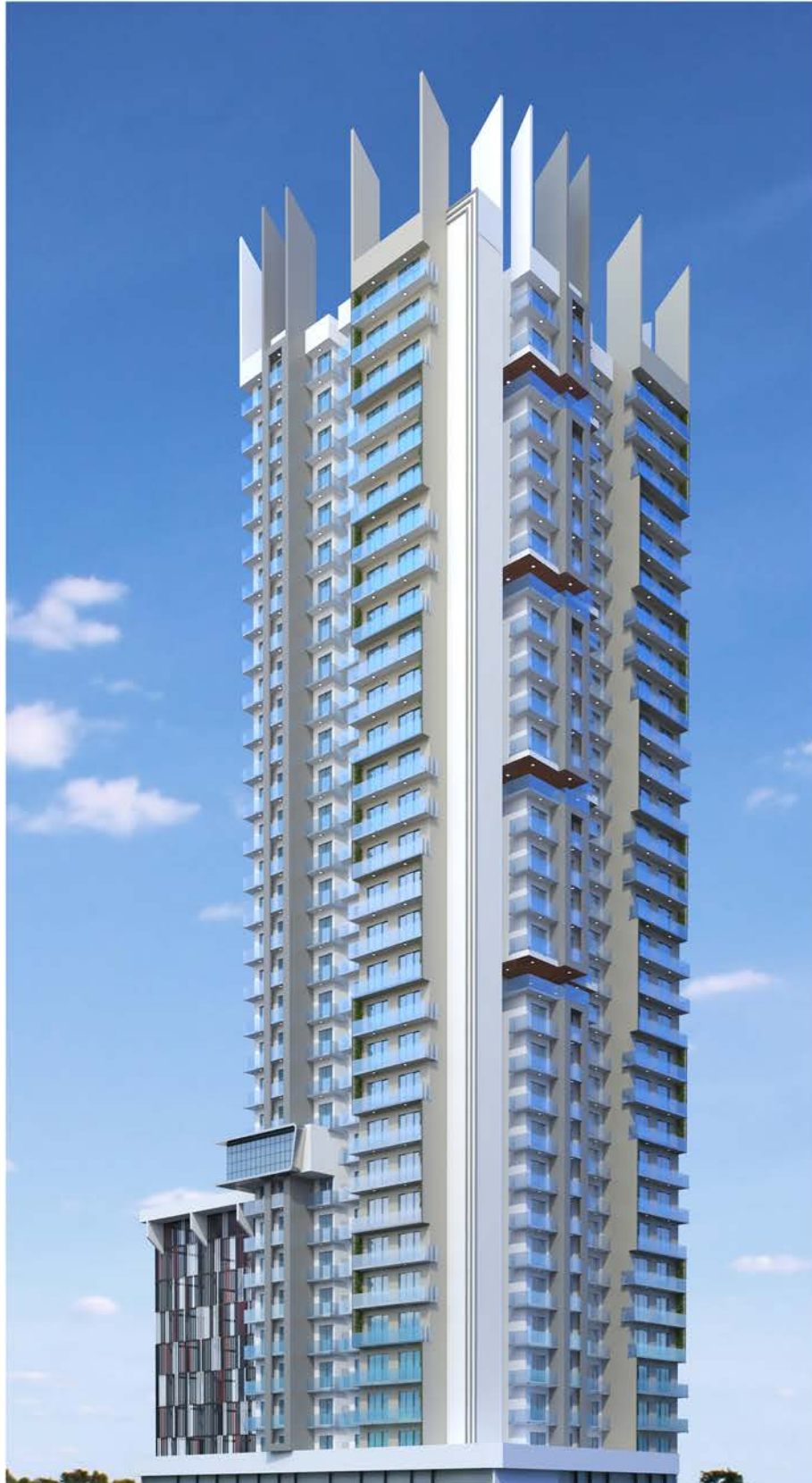
The first G+30 storeyed building of Thane