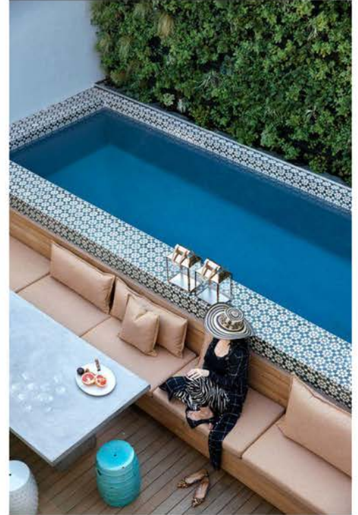
8 TH FLOOR – POOL TERRACE