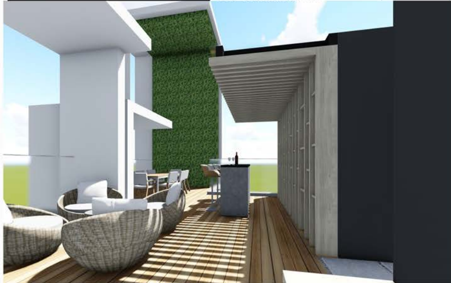
SKY BAR & DINING TERRACE (23RD FLOOR)